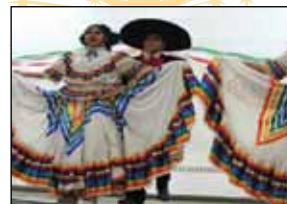
FRI., JUNE 29 - SUN., JULY 1 HISPANO FEST