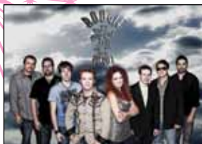
SATURDAY, JUNE 30 BOOGIE & THE YO-YO'Z