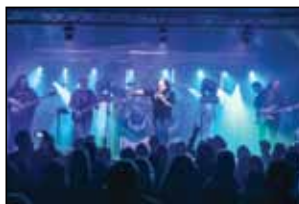
SUNDAY, JULY 1 SEPARATE WAYS THE JOURNEY EXPERIENCE