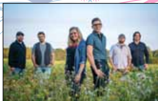
FRIDAY, JUNE 29 GRAND UNION