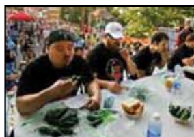
◀ Jalapeno Eating Contest